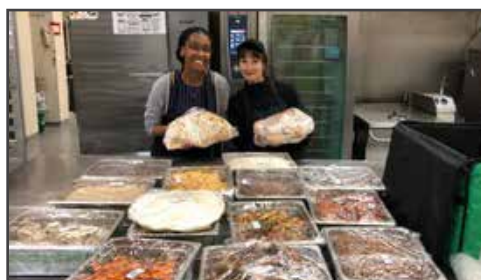
Food Recovery Network