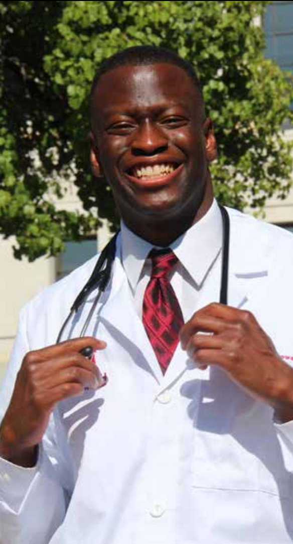
Ola Omotowa Bennion Center Alum