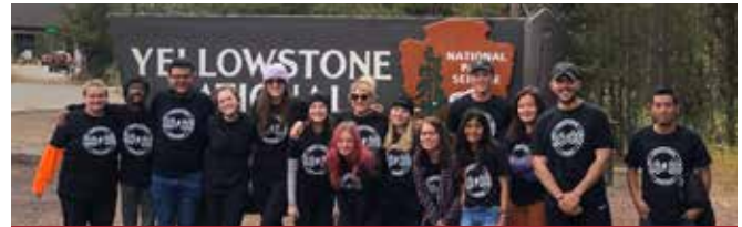
Wildlife Habitat Conservation