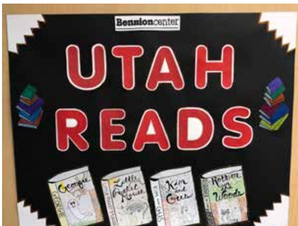
Storytelling project in Rose Park