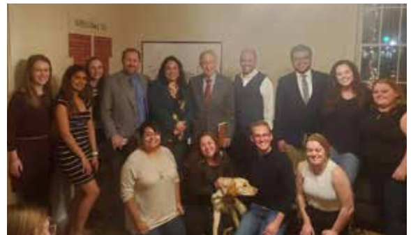
Service House Dialogue