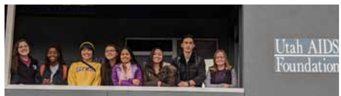
Local HIV & AIDS team experience in SLC

Even though all spring break experiences were cancelled due to COVID-19 travel restrictions, the spring teams still created local experiences for their participants.