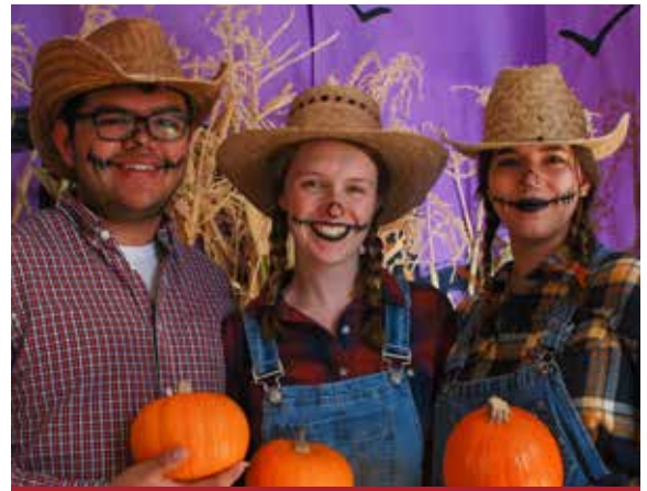
Officer's Hollow Halloween

Sustainability: Individual & Systemic Scales - Cancelled due to COVID-19