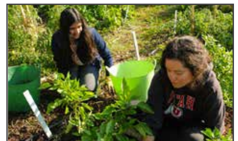
Edible Campus Gardens