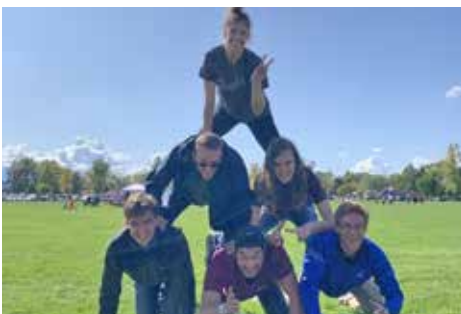
First-Year Service Corps