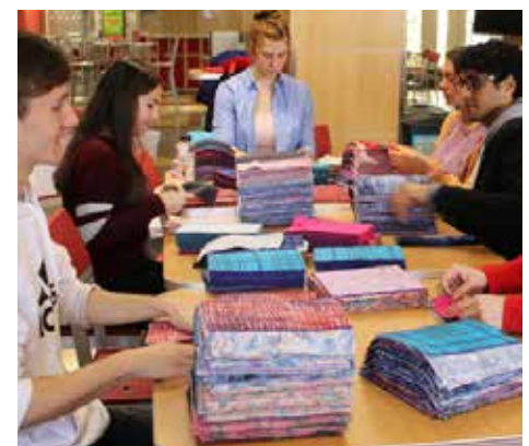
Days for Girls kits