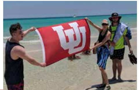
Cuba - Summer 2019