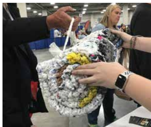
Bags to Beds sleeping mats