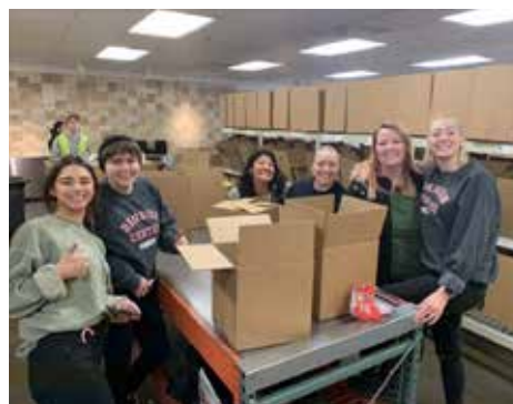
Scholars volunteering together at the Utah Food Bank during a Saturday Service Project